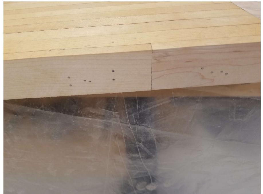
Blade cut through staples seen in this photo