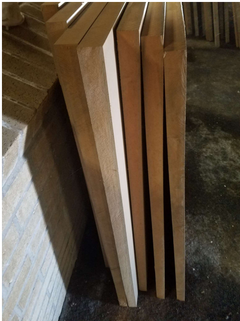
Sample MDF panel had some counterbored holes in them