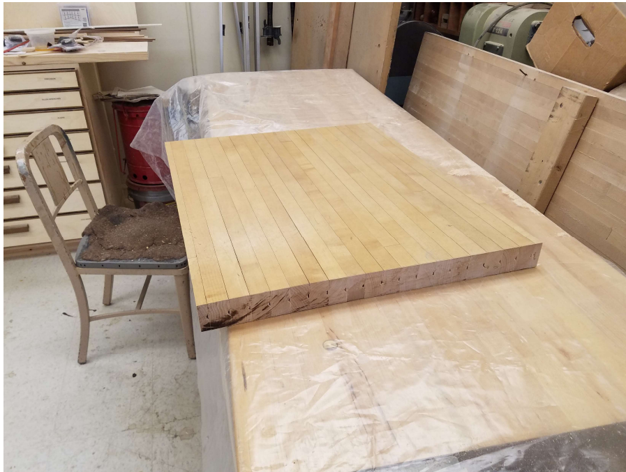
Used circular saw with a home-made track and demo blade for wood and nails. Worked great